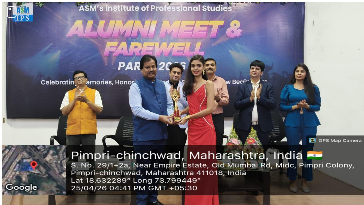
Pimpri-chinchwad, Maharashtra, India 🇮🇳 S. No. 29/1+2a, Near Empire Estate, Old Mumbai Rd, Midc, Pimpri Colony, Pimpri-chinchwad, Maharashtra 411018, India Lat 18.632289° Long 73.799449° 25/04/26 04:41 PM GMT +05:30