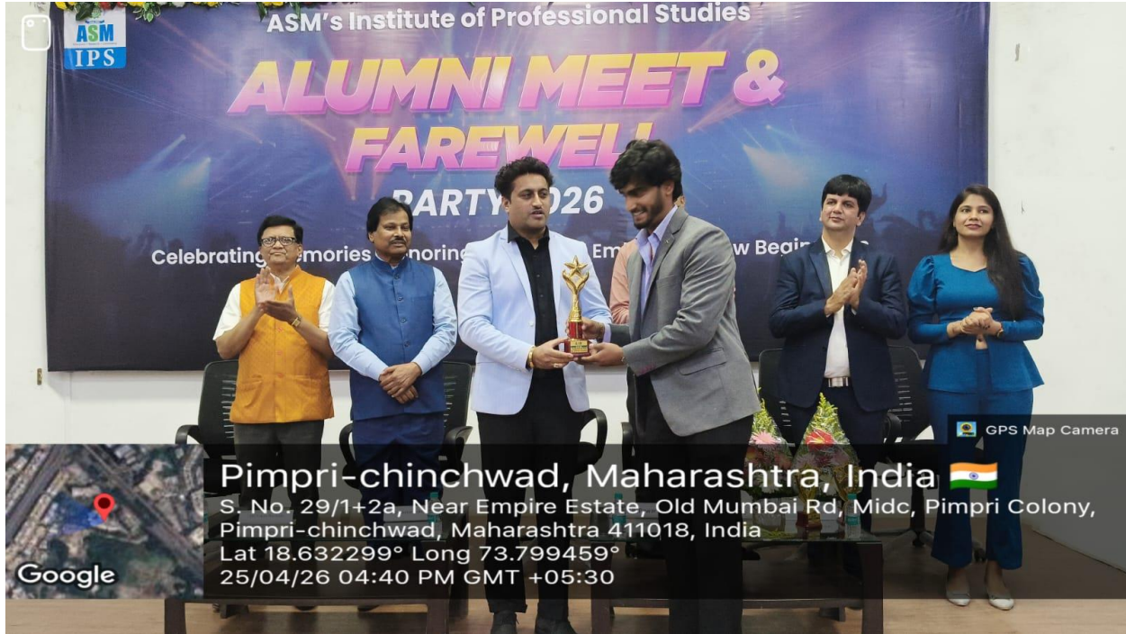
Pimpri-chinchwad, Maharashtra, India 🇮🇳 S. No. 29/1+2a, Near Empire Estate, Old Mumbai Rd, Midc, Pimpri Colony, Pimpri-chinchwad, Maharashtra 411018, India Lat 18.632299° Long 73.799459° 25/04/26 04:40 PM GMT +05:30