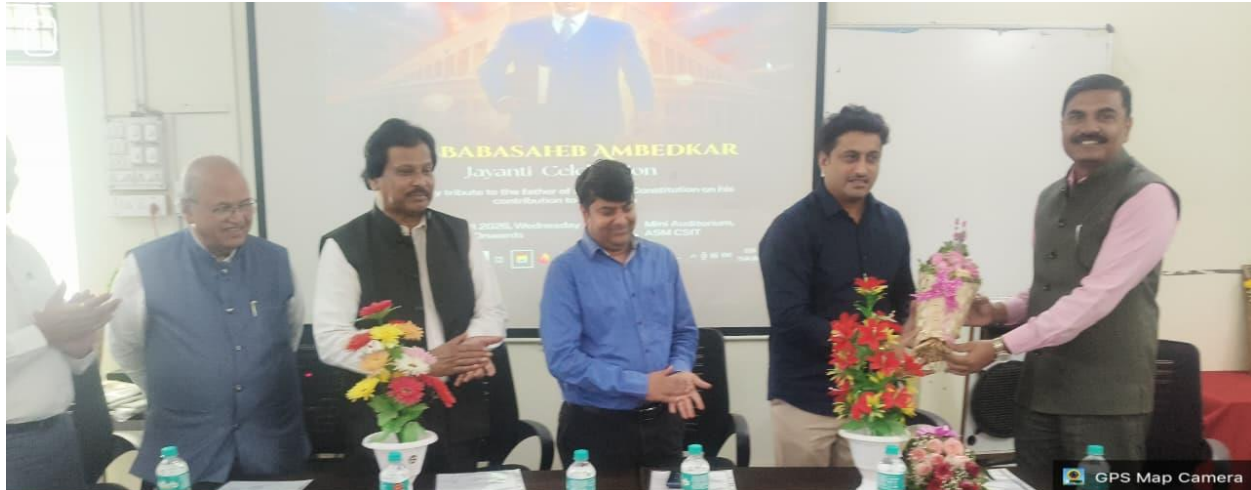
Pimpri-chinchwad, Maharashtra, India 🇮🇳 S. No. 29/1+2a, Near Empire Estate, Old Mumbai Rd, Midc, Pimpri Colony, Pimpri-chinchwad, Maharashtra 411018, India Lat 18.632241° Long 73.799183° 15/04/26 12:34 PM GMT +05:30