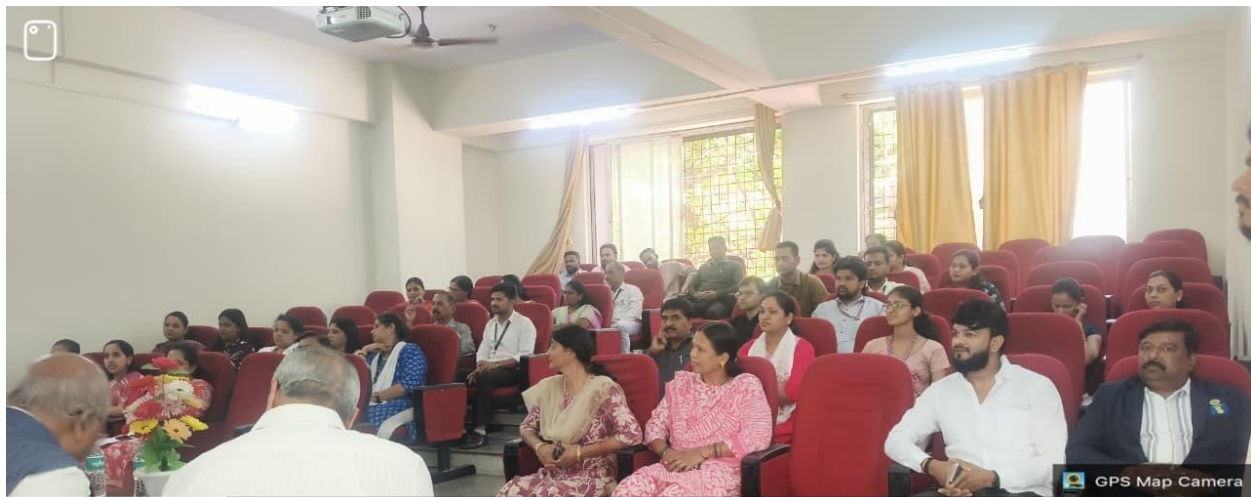
Pimpri-chinchwad, Maharashtra, India 🇮🇳 S. No. 29/1+2a, Near Empire Estate, Old Mumbai Rd, Midc, Pimpri Colony, Pimpri-chinchwad, Maharashtra 411018, India Lat 18.632241° Long 73.799183° 15/04/26 12:33 PM GMT +05:30