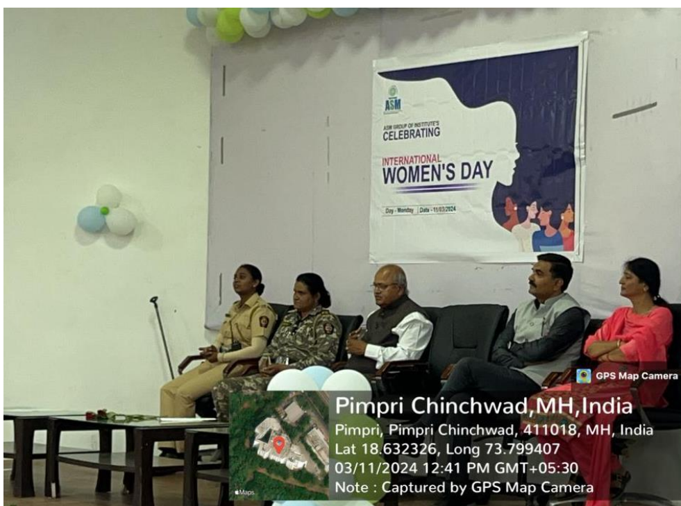
Pimpri Chinchwad, MH, India Pimpri, Pimpri Chinchwad, 411018, MH, India Lat 18.632326, Long 73.799407 03/11/2024 12:41 PM GMT+05:30 Note : Captured by GPS Map Camera