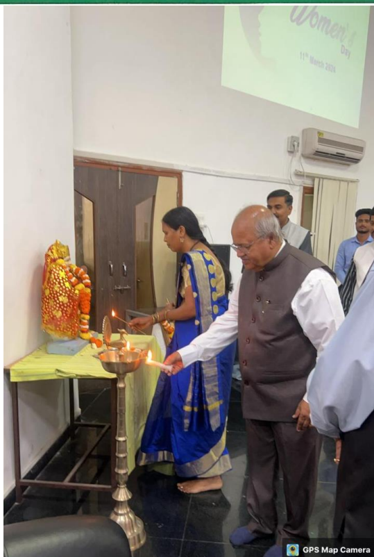
Pimpri Chinchwad, MH, India Pimpri, Pimpri Chinchwad, 411018, MH, India Lat 18.632287, Long 73.799463 03/11/2024 12:21 PM GMT+05:30 Note : Captured by GPS Map Camera