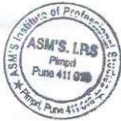
Director ASM's IPS

All staff members and Students of MBA I year and II year of ASM's Institute of Professional Studies are hereby informed that organized " Blood donation Camp " on 23/03/2017 . All are hereby requested to remain present in the institute auditorium at 9:00 am