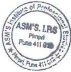
Director ASM's IPS

The Students who have registered for addon course Tally ACE are here by informed that Tally ACE hand on practical's commencing from 01/09/2019.