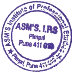
Director ASM's IPS