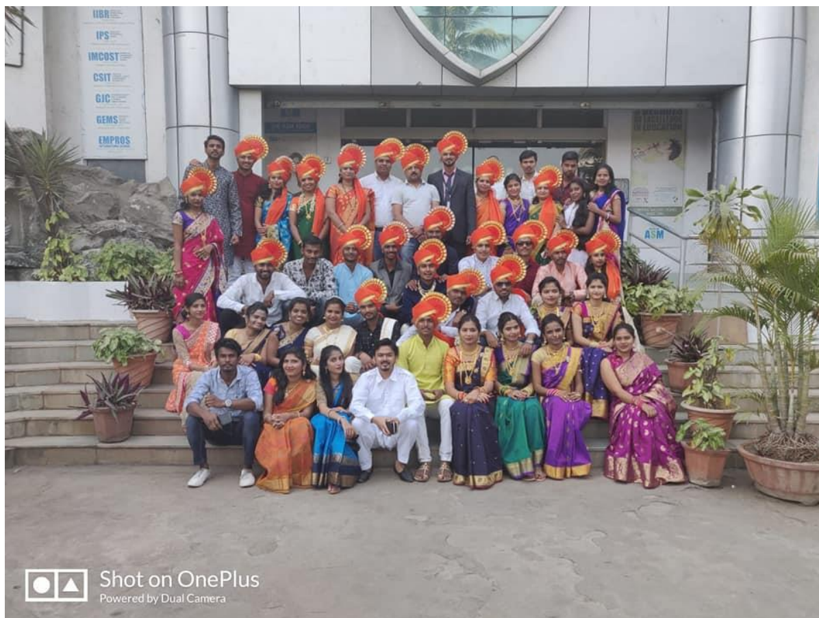
Students and Staff members in traditional outfits.