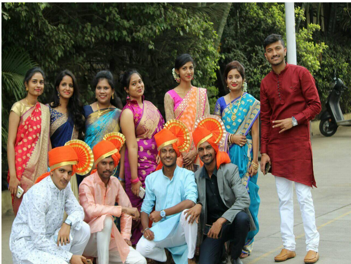
Students of ASM's IPS in traditional Outfit.