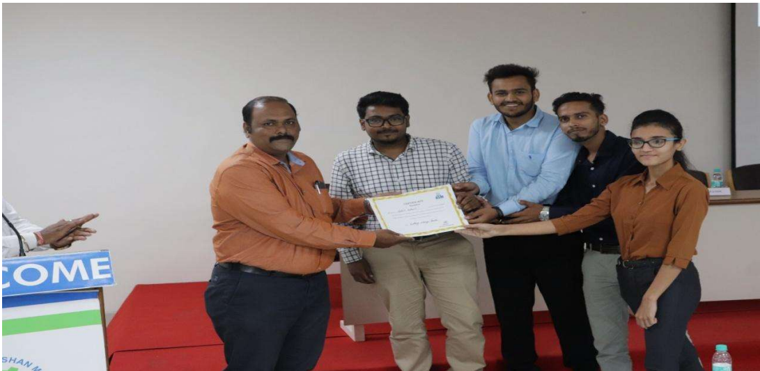
The 1 st Runner up team was Team No. 2, who presented on “Battery charge Power Stations”