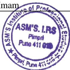
Director ASM's IPS