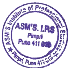
Director ASM's IPS