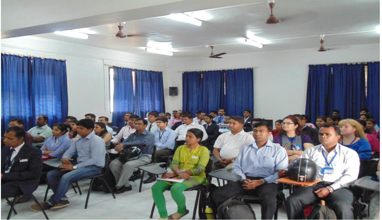
All faculties also took part actively in the hearing speech PM .