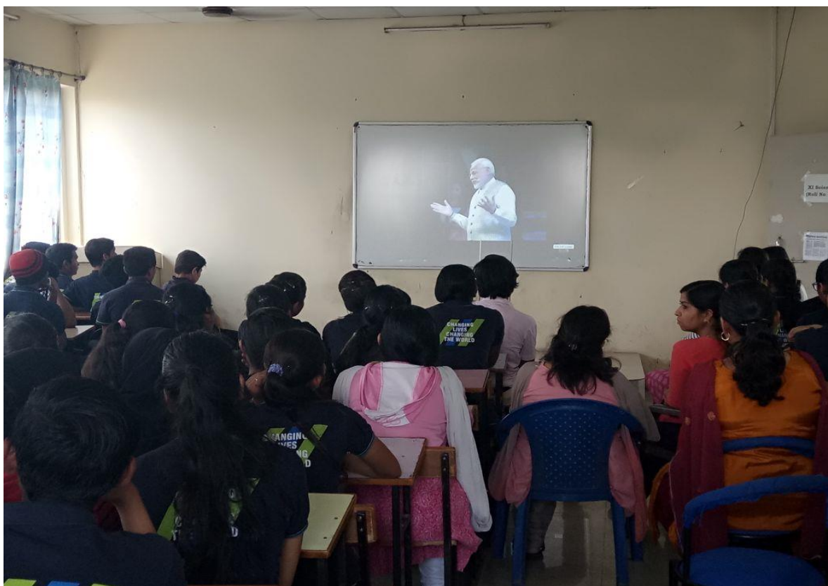
Large no. of students were present to celebrate the event.