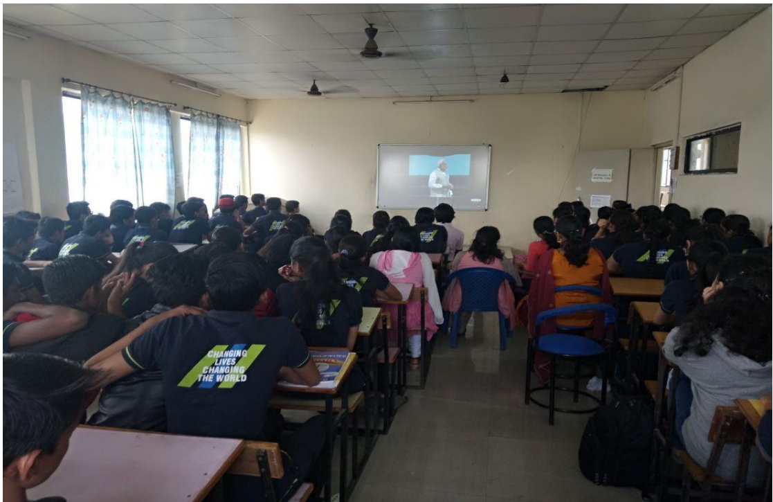
Students listening to Prime Minister Mr. Narendra Modi's Speech at the time of Inauguration of "Statue Of Unity".