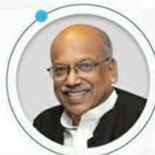
Chief Guest Shri. Sanjay Dhotre Union Minister of State for Human Resource Development, Communications and Electronics & Information Technology, Government of India