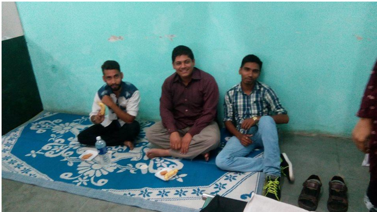
Students having Snacks after Blood Donation.