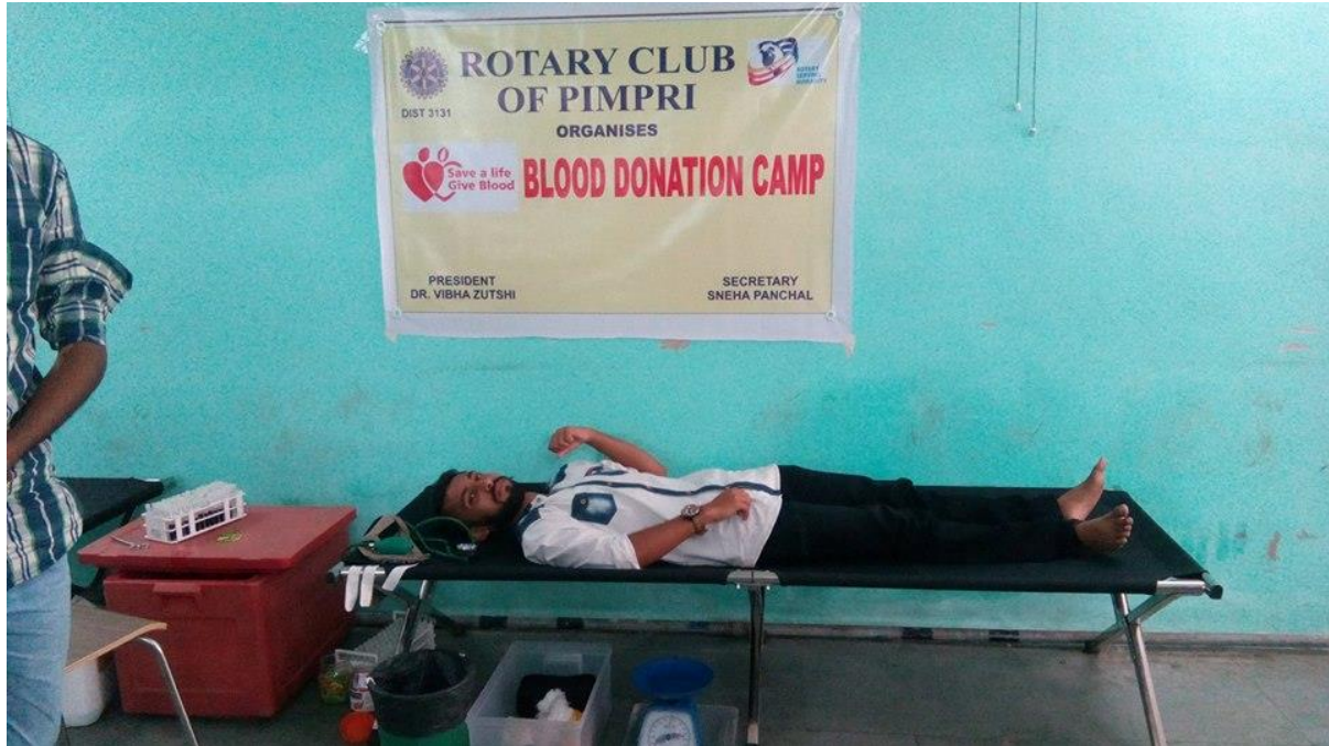
Student Donating Blood.