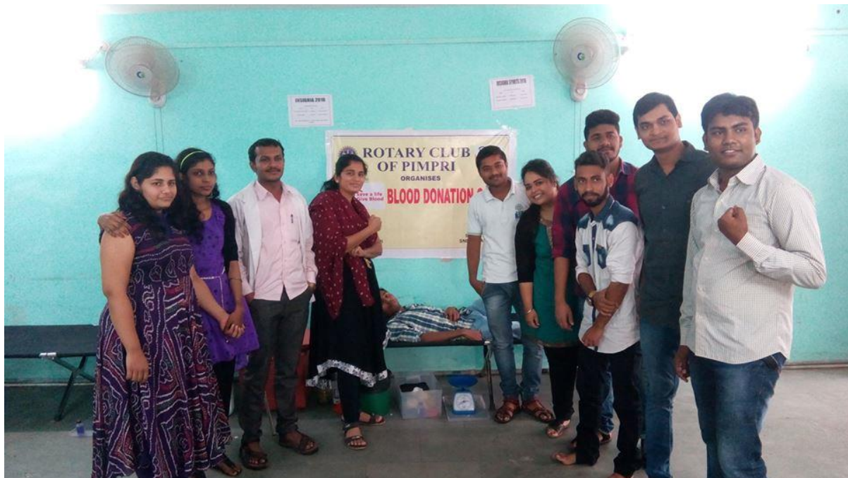
Students Gathered for Blood Donation.