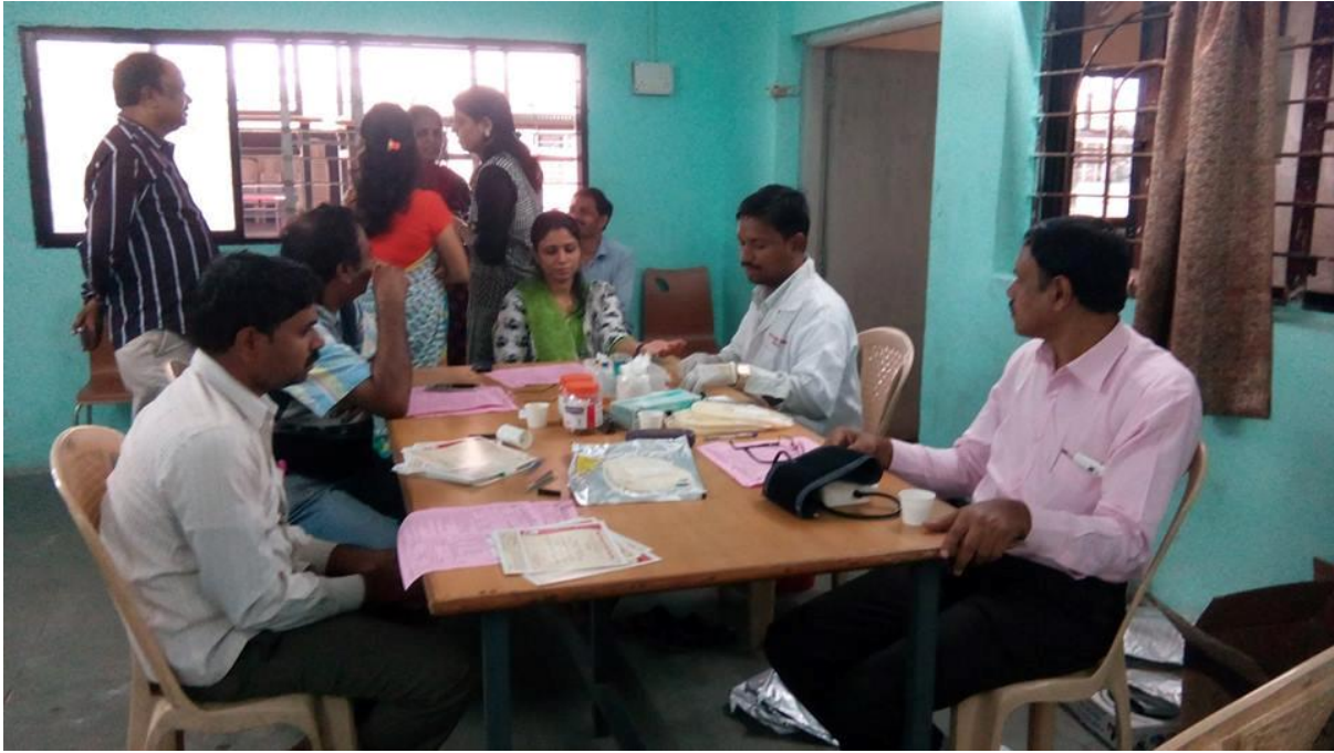
Faculty registering for Donation of Blood.